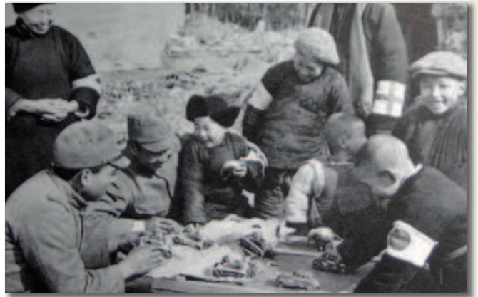
An amusing conversation between Nanking citizens and Japanese soldiers Dec.20, 1937

In addition to Japan’s noble samurai spirit, the brothel system ran by private