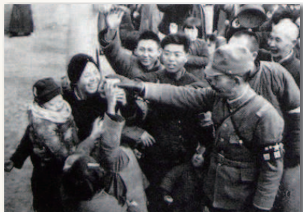
A Chinese family, who receive sweets from Japanese soldiers Dec. 20, 1937

But, today, a thick pile of evidence has revealed that the incident in Nanking was