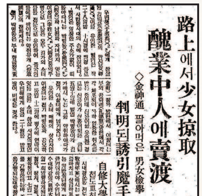
An new paper's article that shows Japanese government busting a Korean trafficking ring. The taking of women by force was done not by Japanese army but by Korean agents.

businesses kept rape incidents within few numbers in the places Japan occupied. Thus, operation of brothels in war zones is not something to blame as war crime but a necessary evil in a strategic and moral sense.