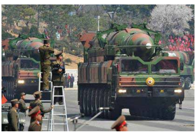
China exports the missile delivery vehicle to North Korea

for transportation and launch of ballistic missiles to North Korea at the midst of a great concern that North Korea might carry out its third nuclear test. This is a clear violation of the UN Security Council Resolution that prohibits export of materials related to weapons of mass destruction to North Korea.